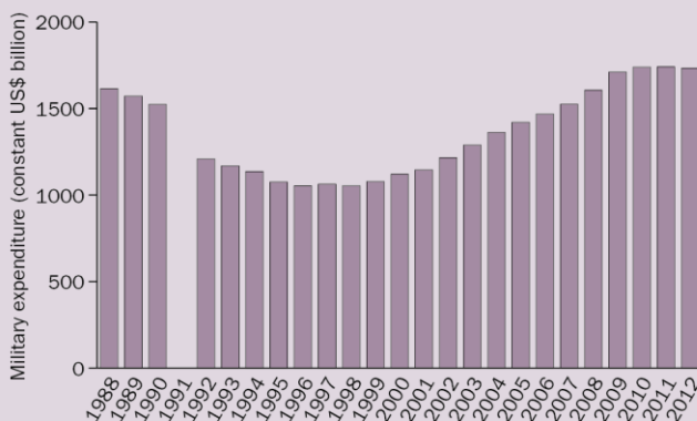
World military expenditure, 1988–2012